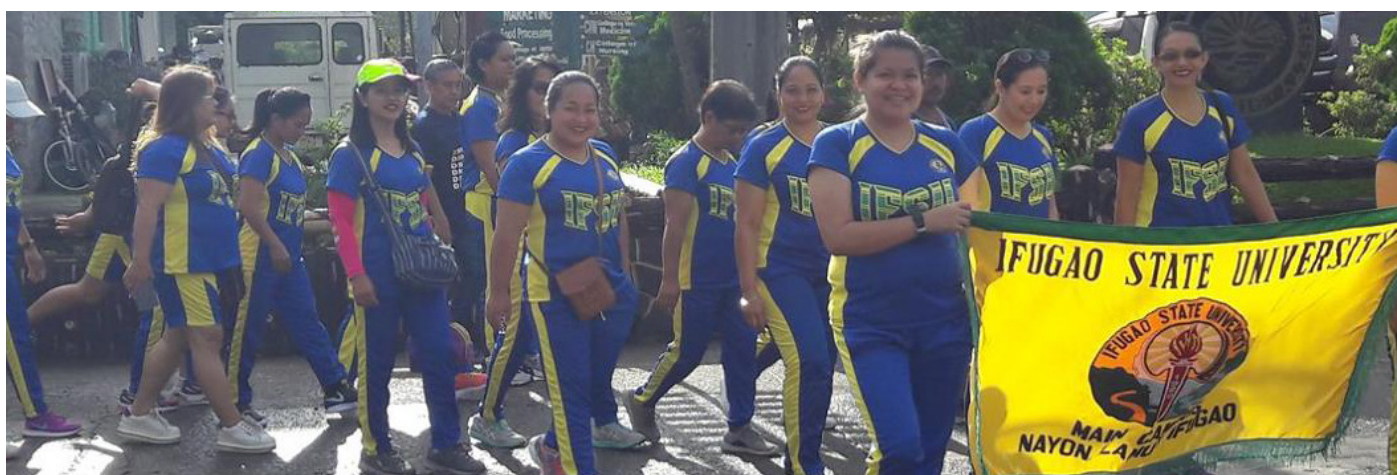
IFSU Fun Shooters and Futsal team during the opening parade for the annual Association of State Colleges and Universities – Solid North ASCU-SN Olympics held in La Trinidad, Benguet on June 18-21, 2018.