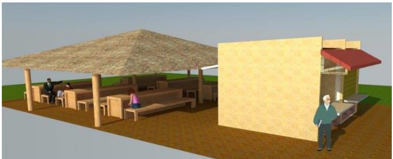
Food Stalls with the Eating Area